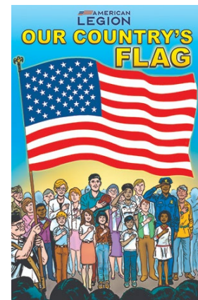
Our Country's Flag Comic Book History, significance, and proper treatment of U.S. flag Item #: 755.300

From government officials to military members, many people who selflessly serve our nation feel honored to hear people reciting the Pledge of Allegiance. It's a way to thank them for their sacrifices!